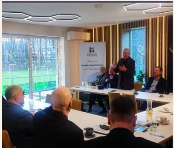
Event for entrepreneurs