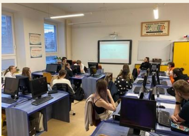
At Přerov Secondary School of Gastronomy and Services