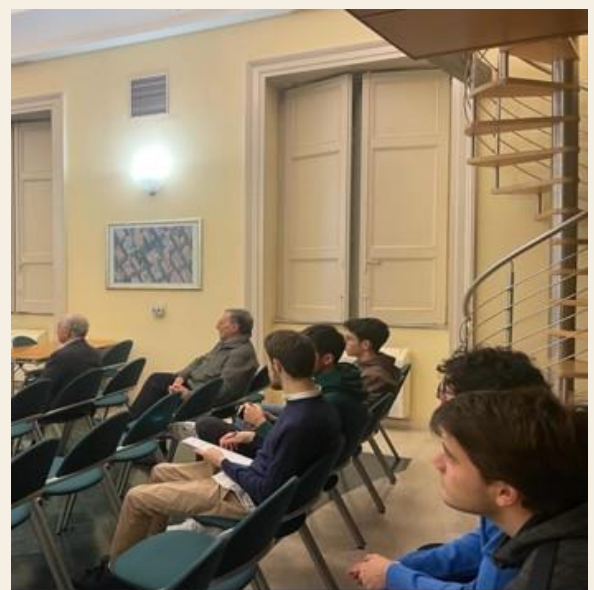
During the event at Residenza Alcantara Residence