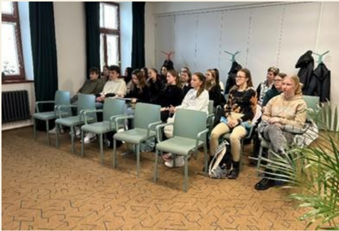
Event for teachers and students

The Prerov Chamber of Commerce organized two conferences to illustrate the results of the project and reflect on the state of the art and the prospects of distance learning in the world of school and professional training. The first took place on 3rd October 2023 with the participation of 70 entrepreneurs and managers, the second was held on 20th February 2024 at new coworking centre IN-HUB Přeřov and was attended by 25 students and teachers of the school Obchodní akademie Přeřov. In both the events examples of best practices in this area and educational materials with video tutorials created in the project