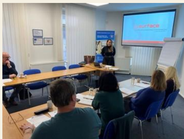
At Přerov Chamber of Commerce