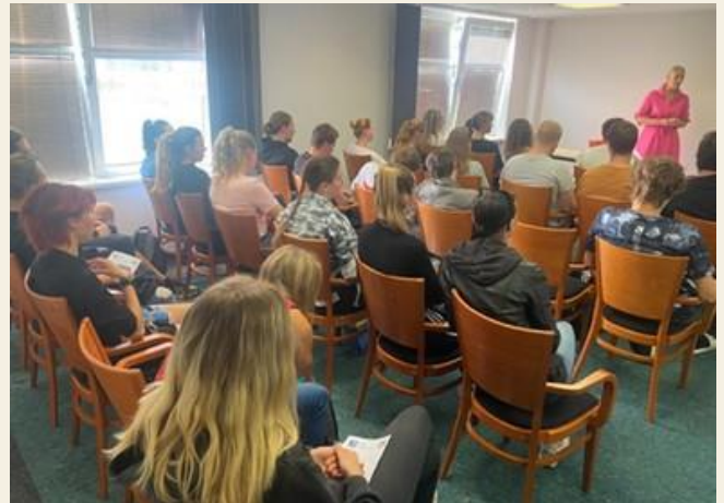
Event for entrepreneurs