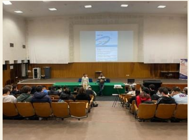
During the event at Cannizzaro Institute